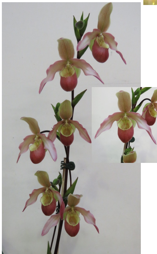
PLANT OF THE MONTH Phrag. Perseus 'Highclare' Grown by T Beck