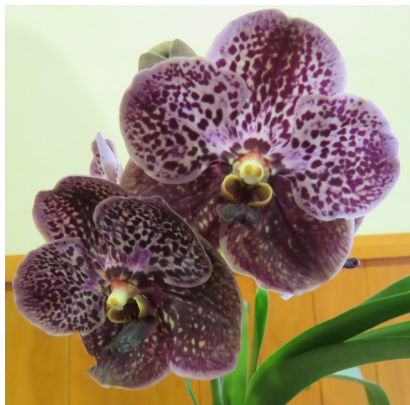
V. Gordon Dillon 'Black'

Some of the Plants benched at the July 2016 Meeting