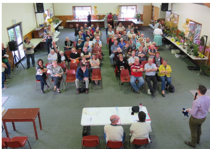
A good attendance on the day. It was great to see some of our "older" members.