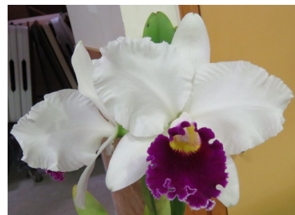
Lc. Melody Fair 'Carol'