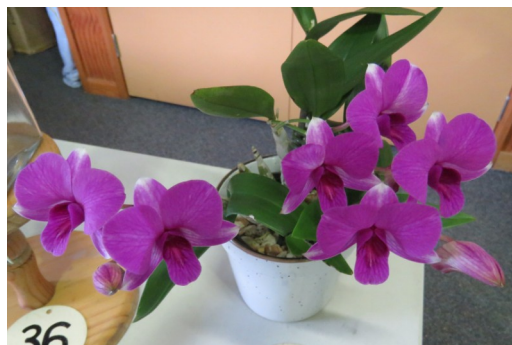
Den. Asternova Aurora