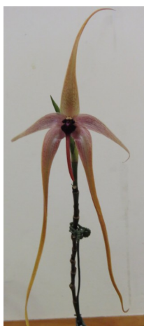
Bulb. echinolabium var. simanis