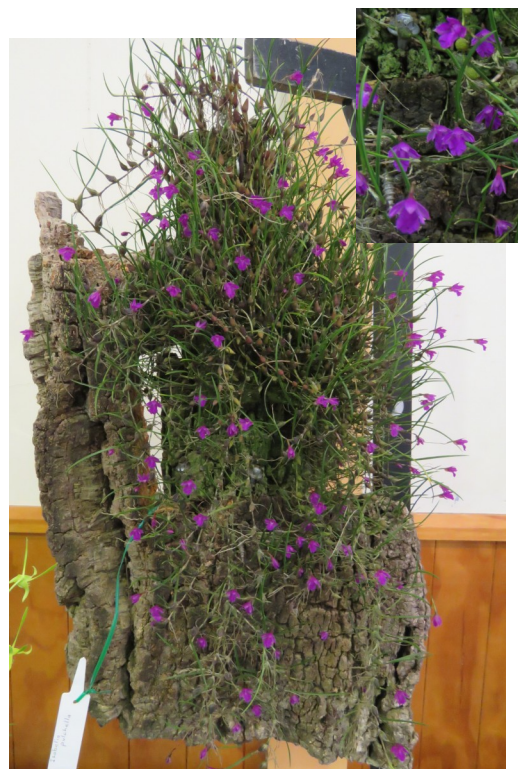
CULTURAL AWARD Isabelia pulchella Grown by B & A Kable