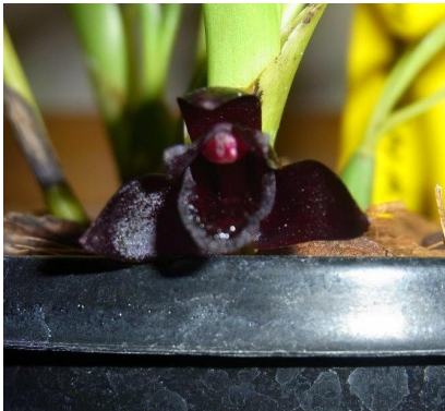
Bch. schunkeana (note the size of the lip on the pot for comparison)