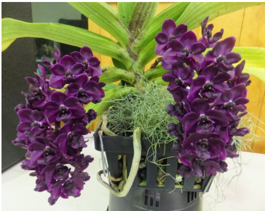
Rhy. gigantea 'Red'