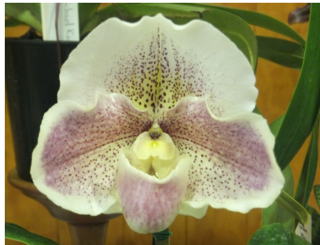
Paph. Carmen Coll 'Sweet Pink'