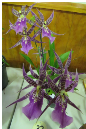
Bratonia Aztec 'Toni'