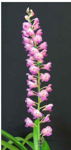
Champion Vandaceous Alliance Hybrid Rhynchorides Memoria Suranaree