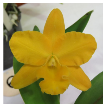
Rth. Free Spirit 'H & R'