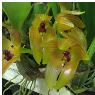
Bulb. membraniflorum 'Orange'