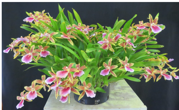
Champion Oncidiinae Alliance Milt. Earl Dunn