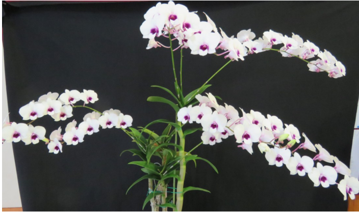
Grand Champion and Champion Dendrobium Hybrid Den. Asternova Snowdrop