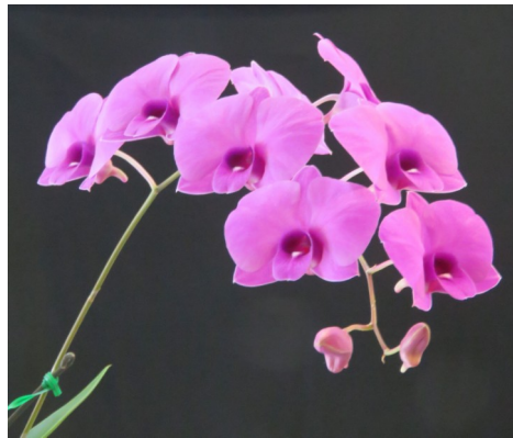
Champion Species Den. bigibbum 'Superbum' Grown by J & B Stratford