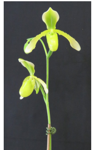
Champion Paphiopedi- lum Hybrid Paph. Henrietta Fujiwara