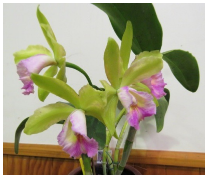
Blc. Hawaiian Passion 'Kermi'