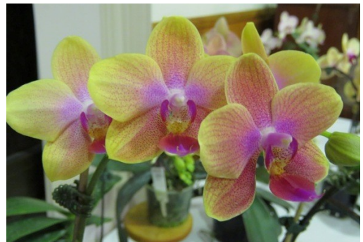
Phal. Brother Orange Runabout