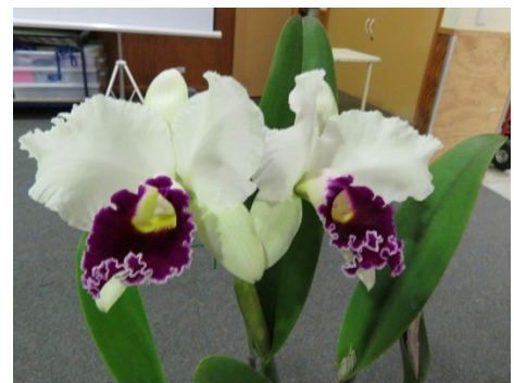
Lc Melody Fair 'Carol'