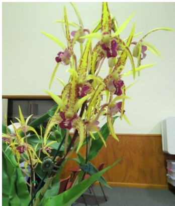
Den. Starsheen 'Botanic Fireworks' x 'Bronson Bronze'