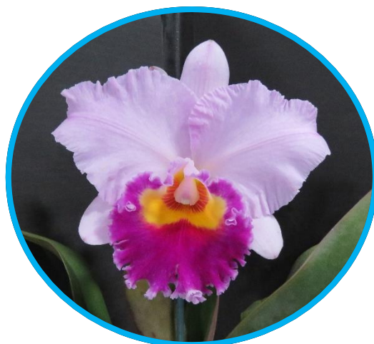
Rlc. Betty's Dream 'Michael'.